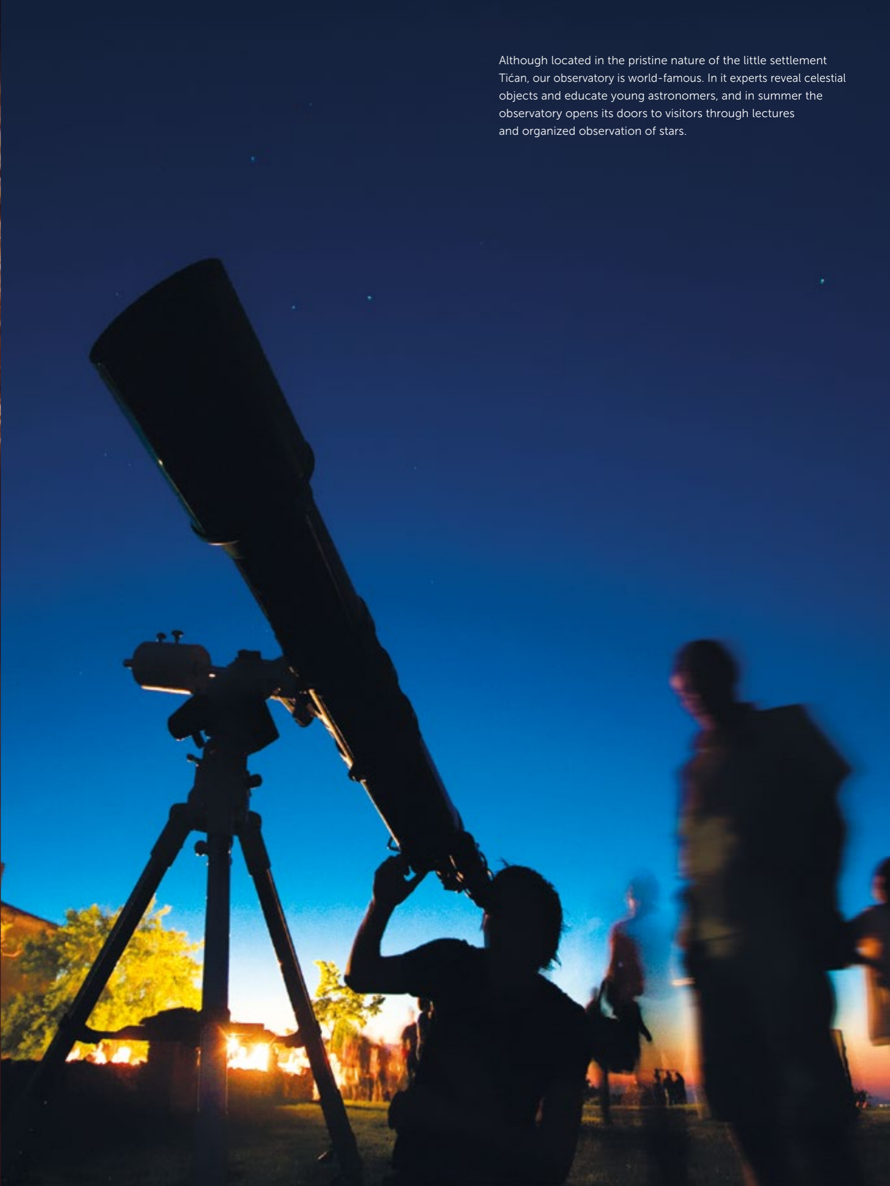
Although located in the pristine nature of the little settlement Tičan, our observatory is world-famous. In it experts reveal celestial objects and educate young astronomers, and in summer the observatory opens its doors to visitors through lectures and organized observation of stars.