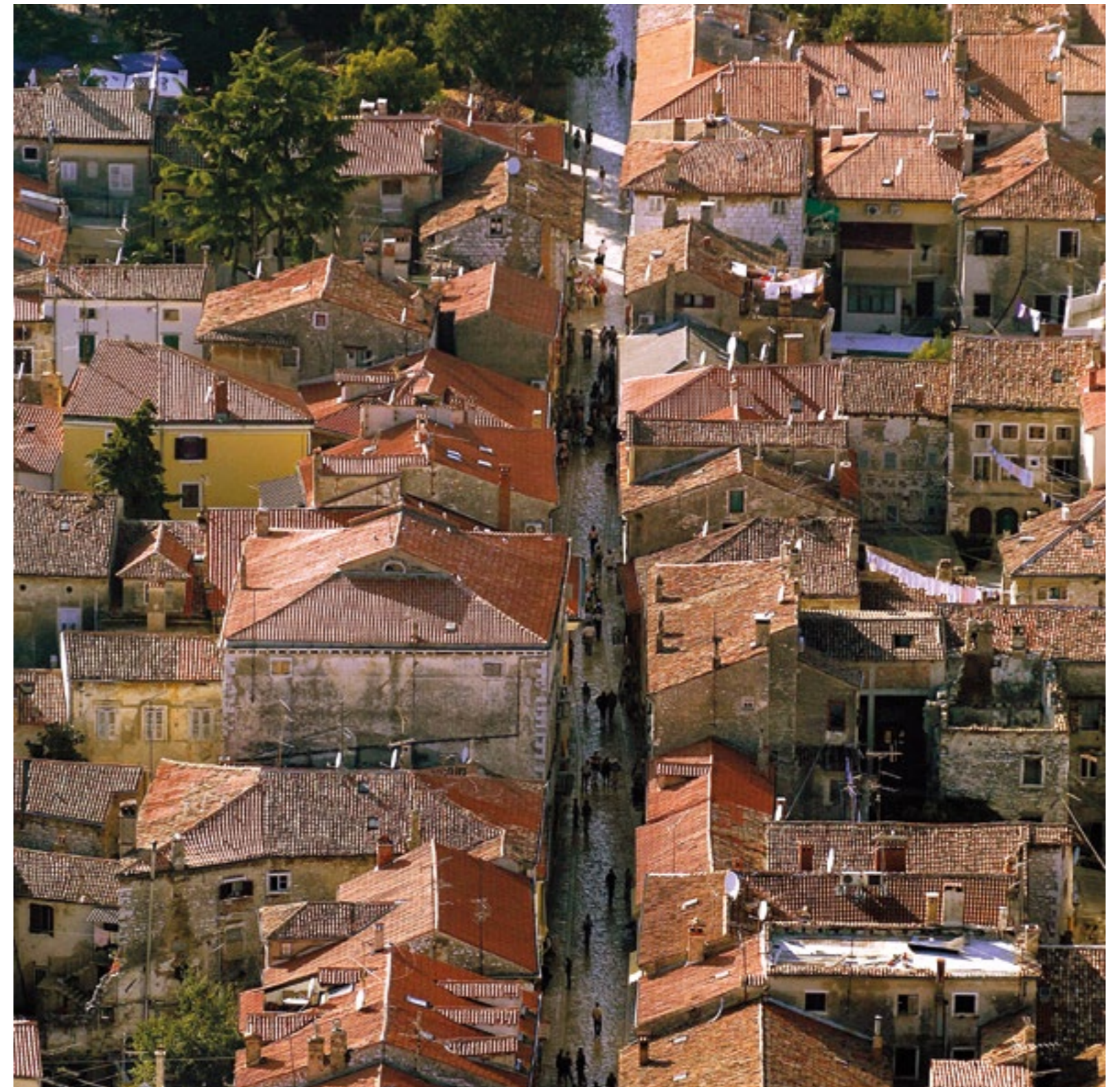
Within the former bulwarks, next to the oldest Marafor Square, remains of ancient temples are preserved and on the rich treasury of old town monuments are enlisted: the Roman house, House of Two Saints, Istrian Assembly, gothic palaces Zuccato and Manzini and palace in Decumanus 5, baroque palaces Sinčić and Vergotini and neoclassical palace Polesini.