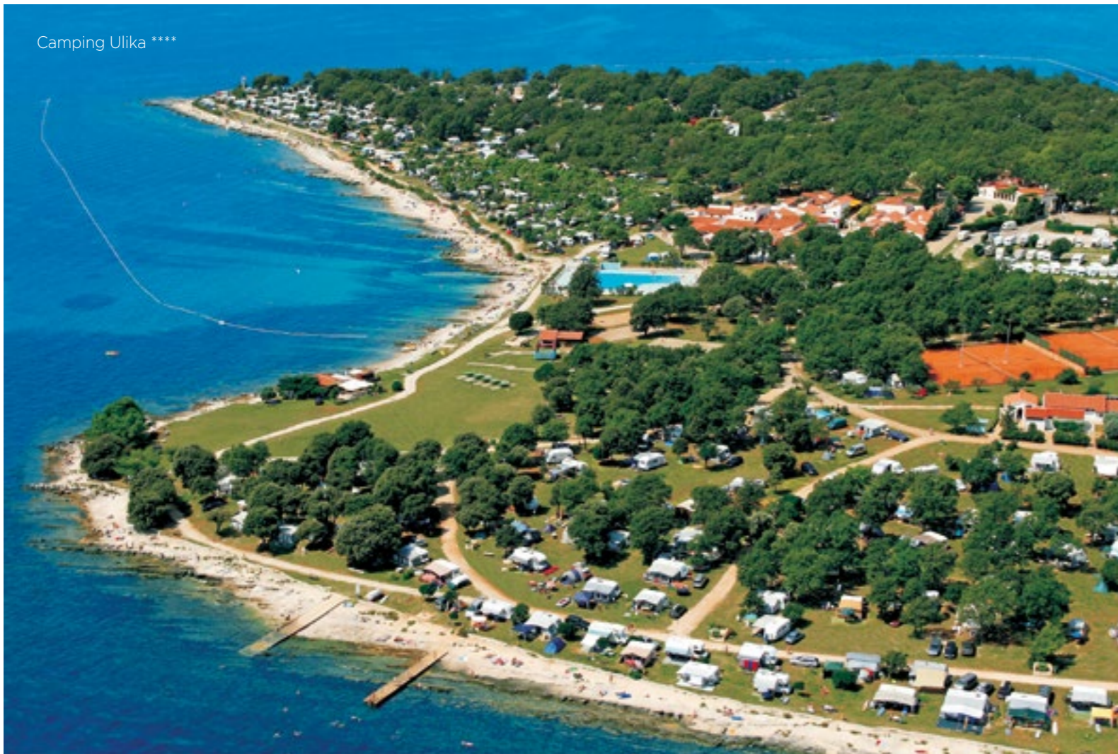
Camping Ulrika ****