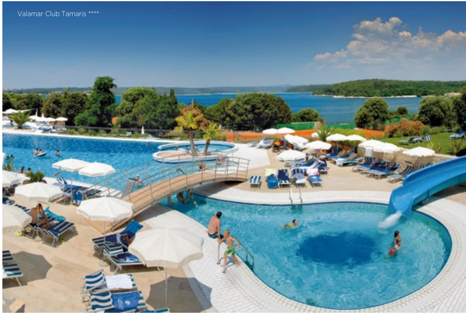
Valamar Club Tamaris ****