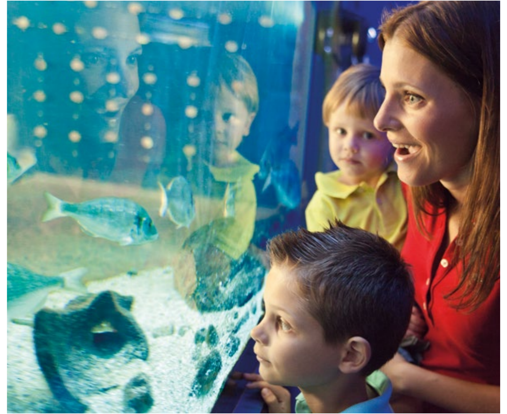
Aquarium in the old town of Poreč in 24 aquariums presents the underwater world and 70 different inhabitants of the Adriatic Sea.