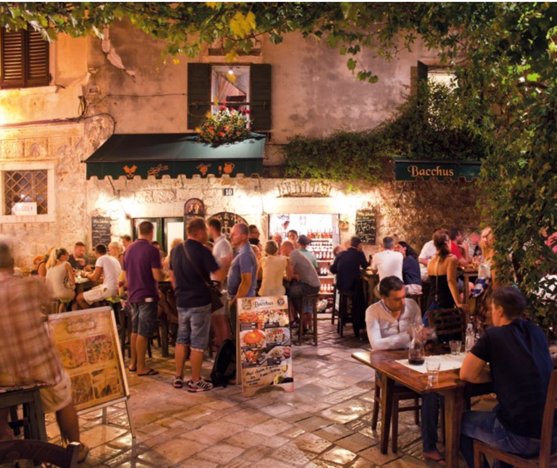
In the evening the town pulsates to the beat of the music coming from the squares and clubs, and lounge bars along the coast offer refreshments in the summer nights. We have designed many fun events, tastings and festivities that last for several days. And private parties are inspired by the sea.