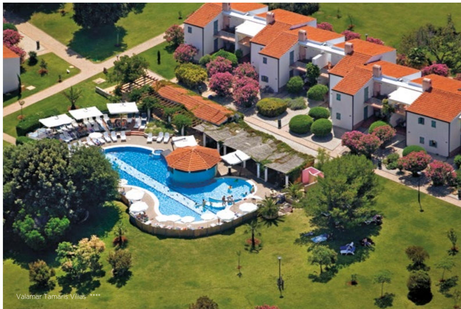
Valamar Tamaris Villas ****