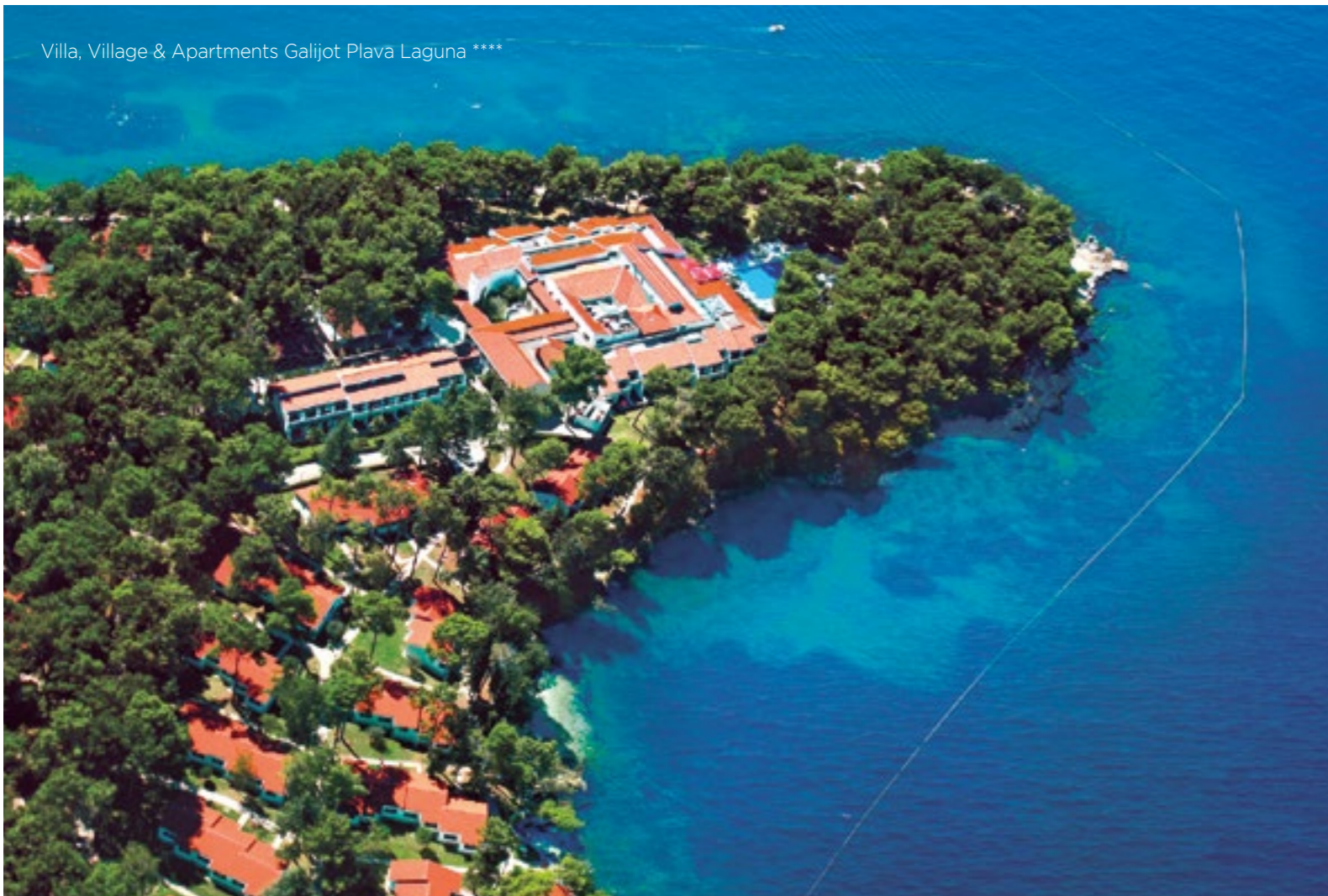
Villa, Village & Apartments Galijot Plava Laguna ****