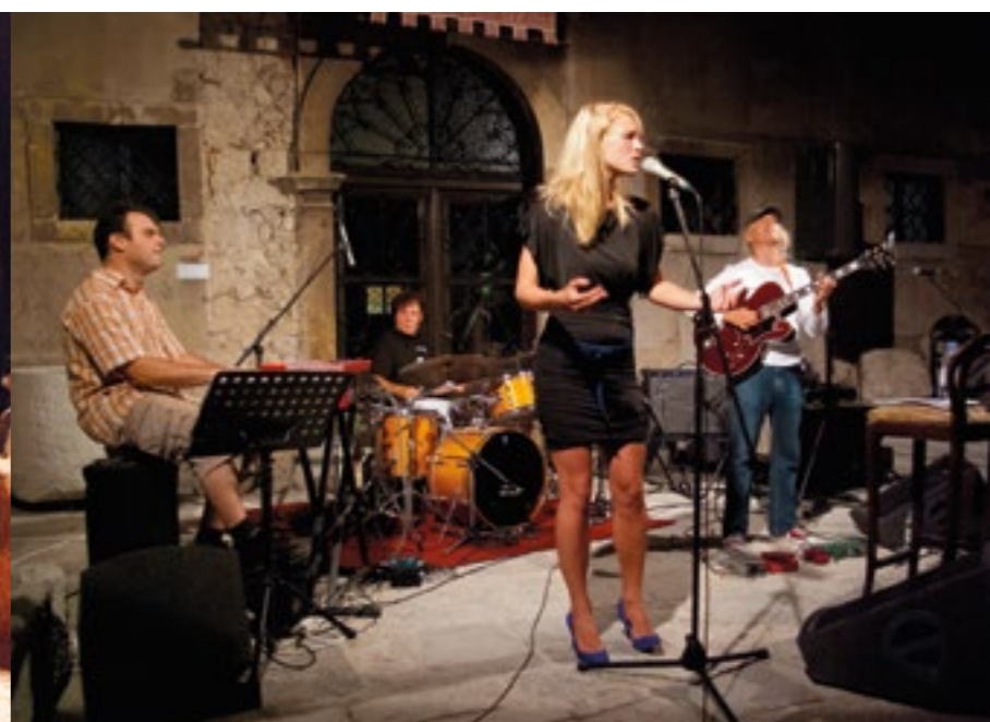
The streets of the old town are scenery for many shows and festivals. Jazz is played in lapidary of Heritage Museum, classical music in Euphrasian basilica, folklore is danced and folk tunes are sung. Squares become homes of street festival, and sometimes we go back in time to 18 th century with historical festival of Giostra.