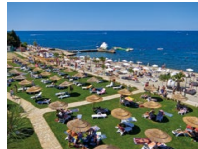
Valamar Pinia Hotel ***

Our sea is pure and beaches pleasant. On as many as twenty beaches, with many amenities and arranged playgrounds for children, Blue Flags are positioned, an internationally recognized guarantee of clear waters and a variety of services, and equal quality of the sea in a series of hidden coves. Sea quality has been monitored here continuously for 25 years!