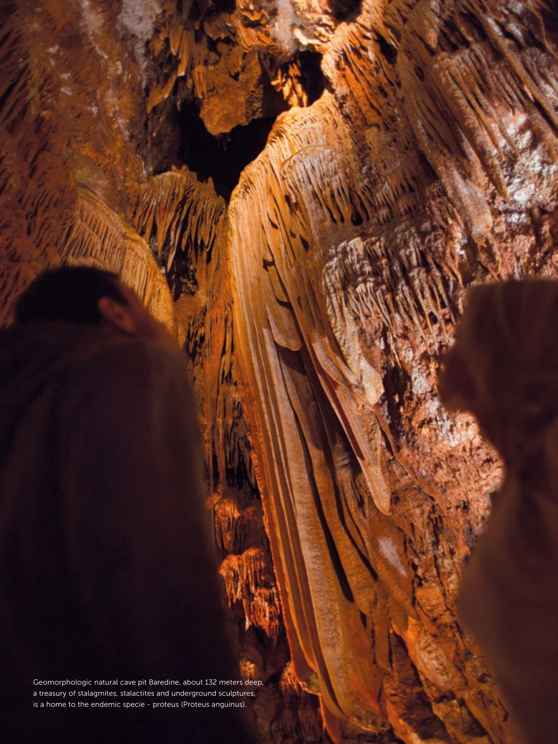
Geomorphologic natural cave pit Baredine, about 132 meters deep, a treasury of stalagmites, stalactites and underground sculptures, is a home to the endemic specie - proteus ( Proteus anguinus ).