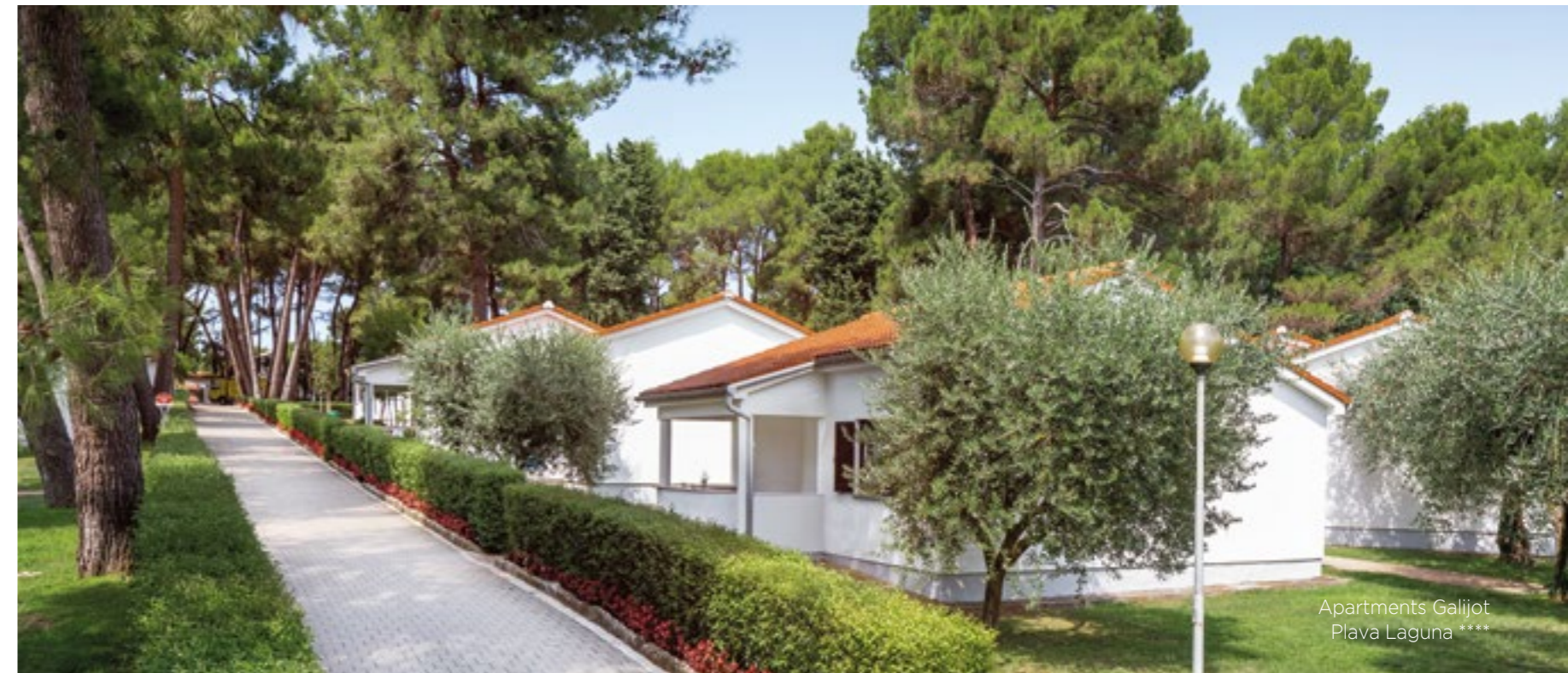
Apartments Galijot Plava Laguna ****