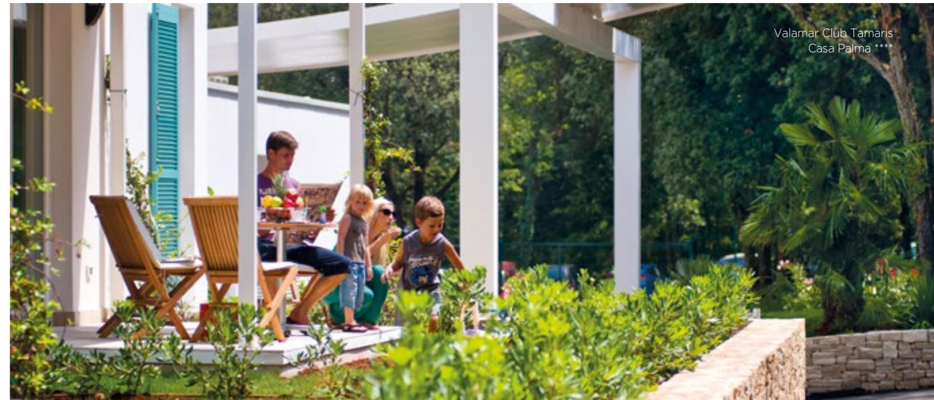
Valamar Club Tamaris Casa Palma ****