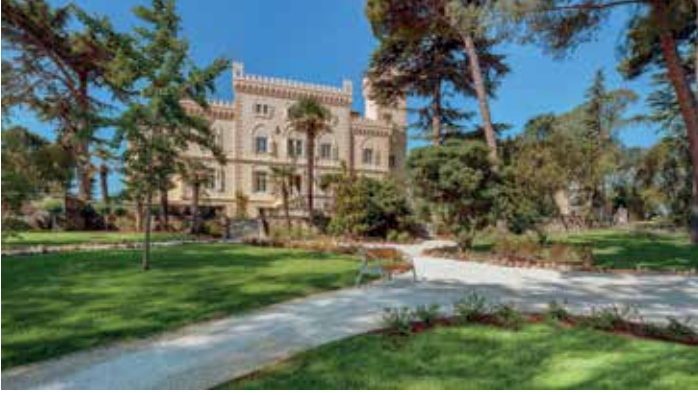
Valamar Collection Isabella Island Resort

small castle | 28 | commissioned in 1886 by Marquis Benedetto Polesini.